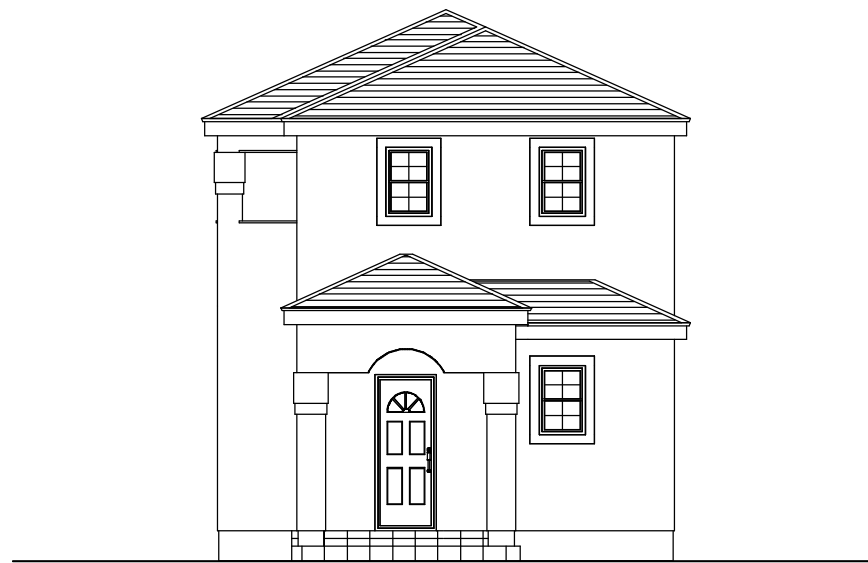
NORTH ELEVATION S : 1 / 100