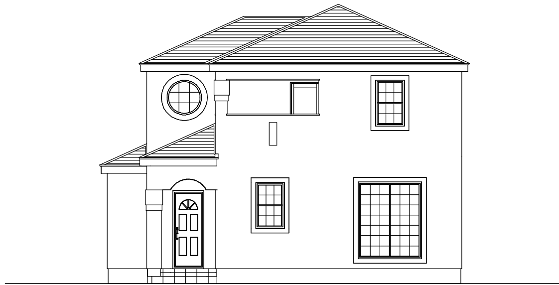
SOUTH ELEVATION S : 1/ 100