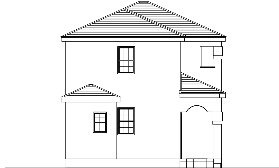
WEST ELEVATION S : 1/ 100